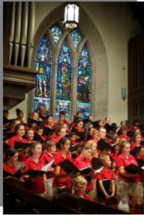
Appleby College, August 2011